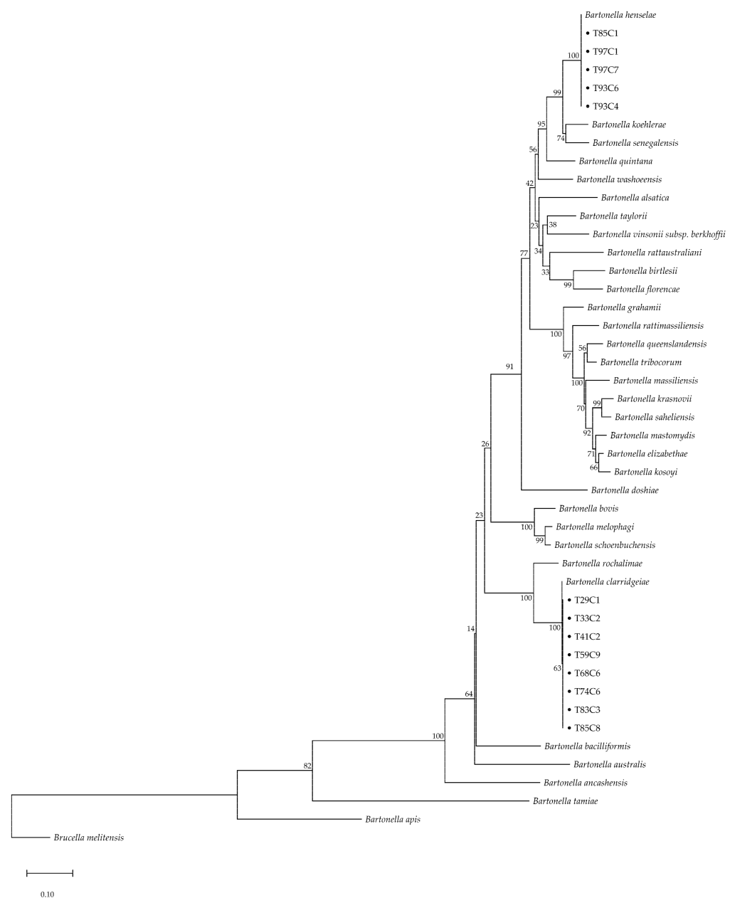
Figure 2. Phylogenetic tree of concatenated sequences ( gltA and ribC ) of Bartonella -positive cats (maximum likelihood tree with GTR + G model with 500 bootstrapping replications); Brucella melitensis is provided as an outgroup; and dots indicate positive samples from the current study.

ACNO: Accession number; Bc: Bartonella clarridgeiae ; Bh: Bartonella henselae ; (-): Amplicon absence; [ ]: % identity.