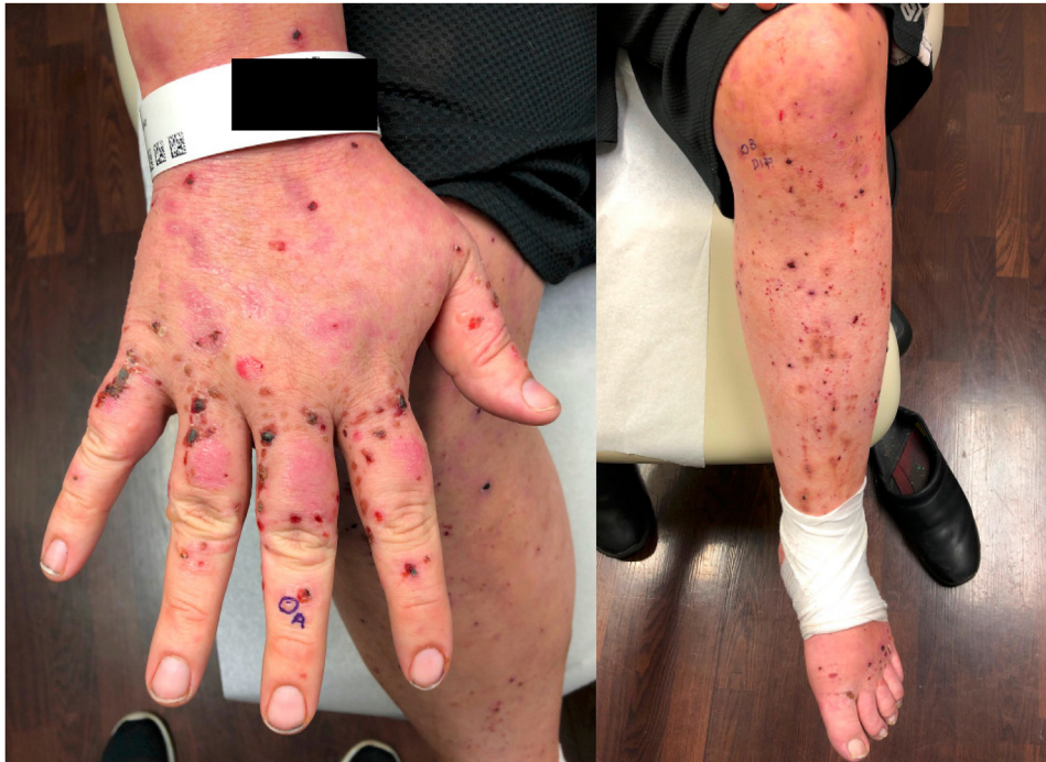
Fig 1. Right hand and left lower extremity of patient.