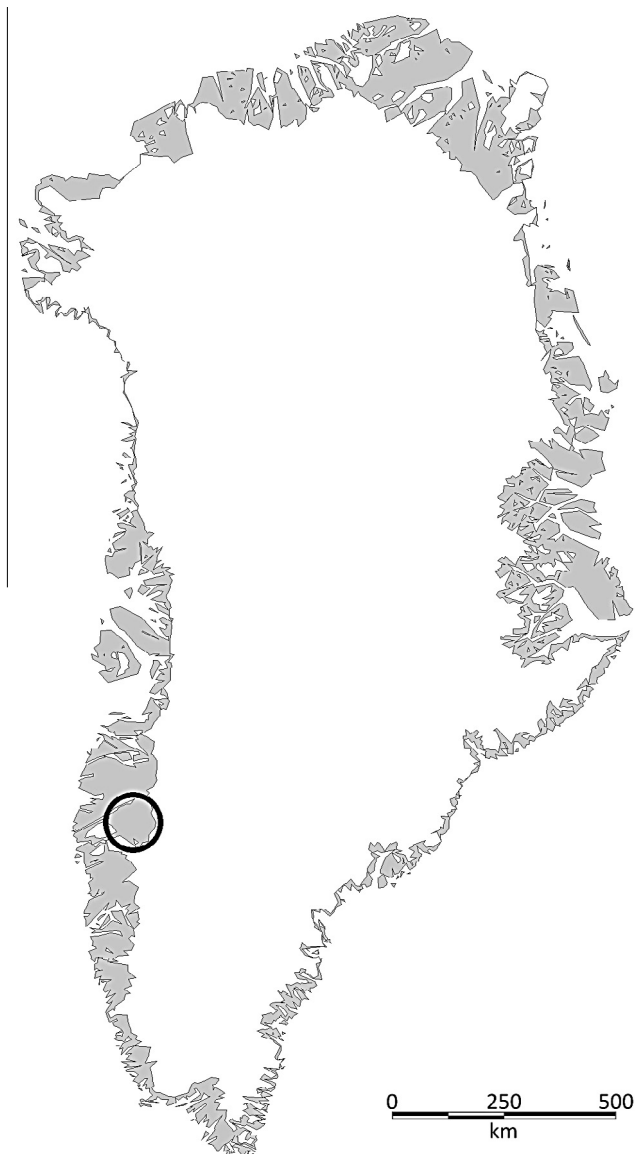
Fig. 1. The location of the muskox population studied in Kangerlussuaq, Greenland (circle).