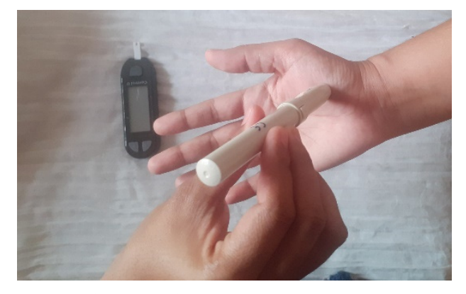
Figure 2. Palm site sampling.

study by convenience sampling method by the principal investigator.