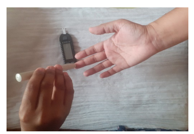
Figure 1. Fingertip.

Patients diagnosed with diabetes mellitus who are aged \geq 18 years, attending diabetes clinic of a tertiary care center were included in the study. Patient with any wound or altered skin integrity in hands, patients with peripheral neuropathy were excluded from the study. Consecutive participants, who attended diabetic clinic and met the inclusion criteria were recruited into the