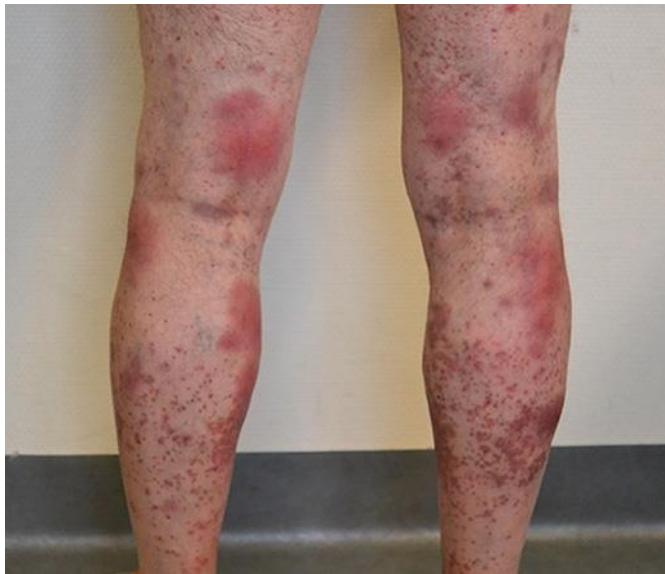
Fig. 3. Tender erythematous plaques over the lower limbs.