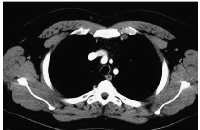
Figure 3 1.2 cm left internal mammary lymph node; unchanged on post chemotherapy chest CT, cause uncertain but it would be an unusual site for seminoma metastases.