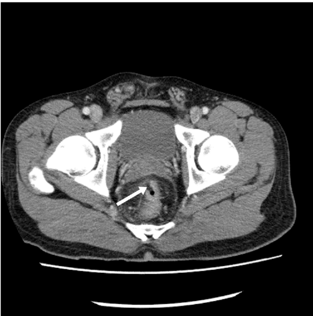
Fig. 1. Coronal computed tomography scan, showing focal disruption of the rectum (white arrow).