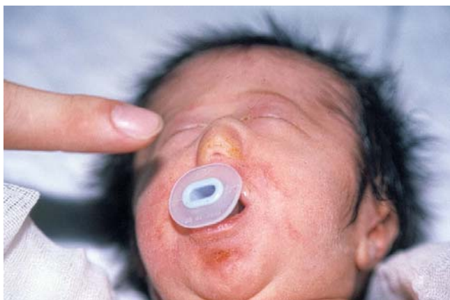
Figure 1 Photograph of the patient.

the nasal nuclei. Nostrils develop from the nasal nuclei. The nasal nuclei migrate posteriorly to form nasal cavities. Meanwhile, the oral and nasal cavities are separated by bucconasal membranes that will rupture at the seventh or