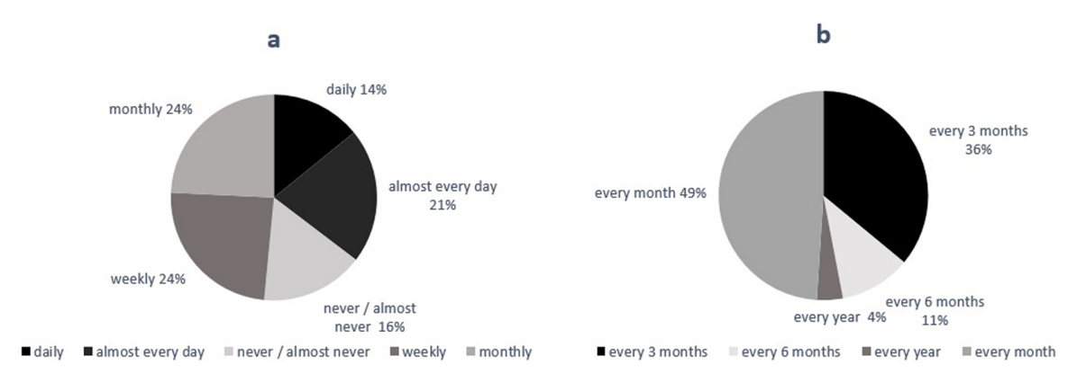
Fig. 2. a-b Reported frequencies of: a) contact lens case cleaning and b) contact lens case replacement for soft reusable lens wearers using multi-purpose solution (n = 144).