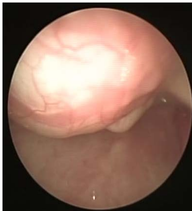
Fig. 4 Preoperative view of case 2