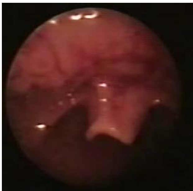
Fig. 2 Postoperative view of case 1