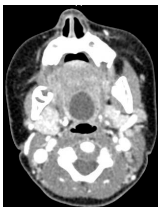
Fig. 3 Preoperative CT imaging of case 2