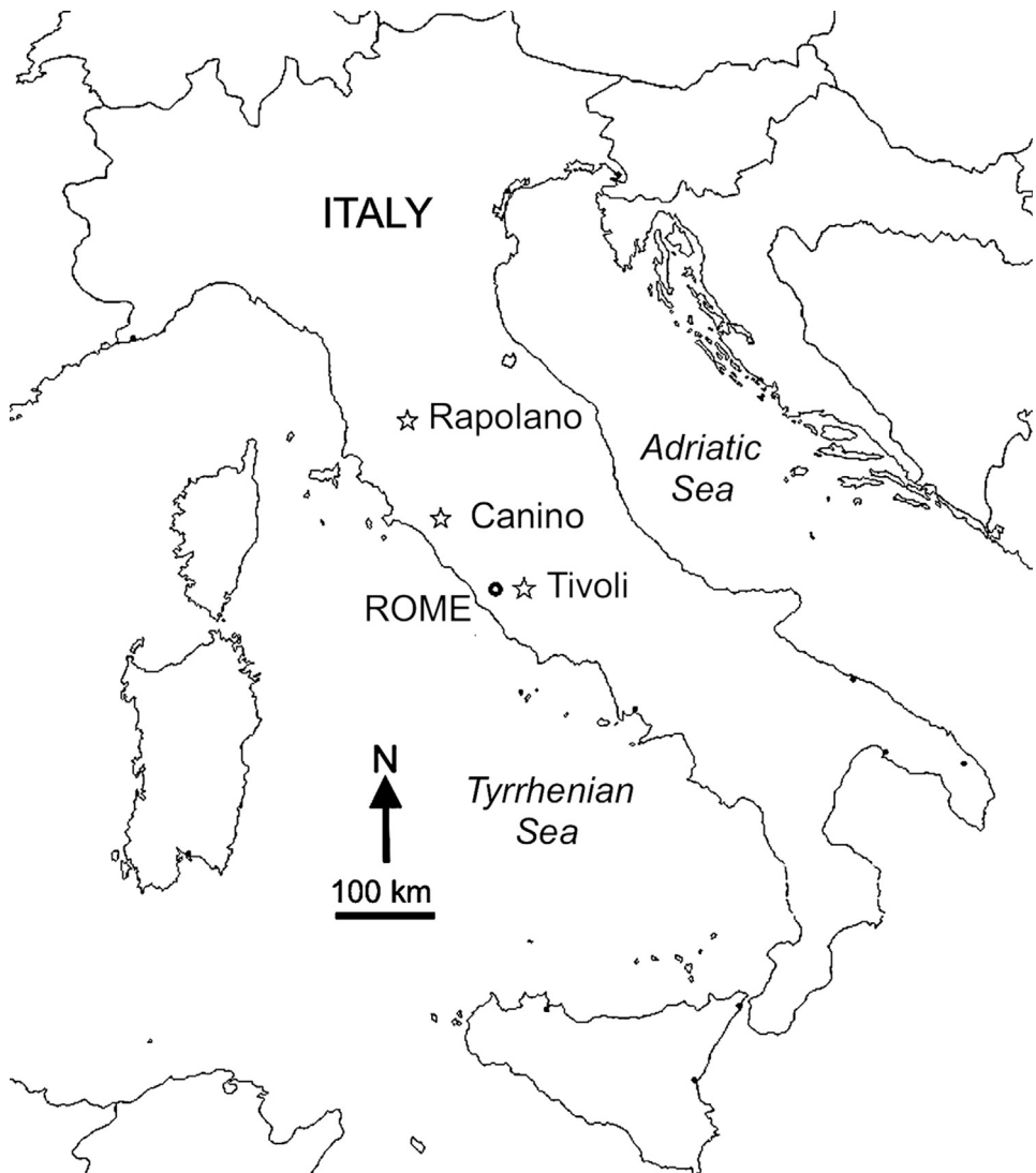
Fig. 1. Location of the sampled travertine outcrops.

Where \rho_b is the bulk density and \rho_p is the particle density (assumed to be 2.7 \text{ g cm}^{-3} , that is the density of calcite).