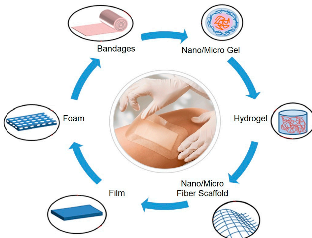
Figure 1. Structure of different wound dressings (adapted from [11], with permission from Elsevier, 2020).

As seen in the alginates, bioactive dressings can directly deliver active compounds to the wound. They may also be composed of materials with endogenous activity which play an active role in the healing process, by activating or driving cellular responses [57,58]. Various antibiotics, vitamins,