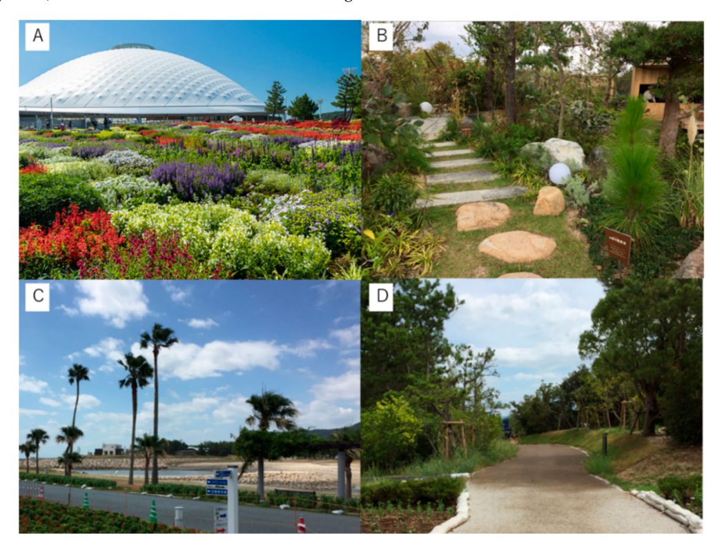
Figure 2. (A): Image of flower area, (B): Image of Garden for Health, (C): Image of ocean area, (D): Image of forest area.