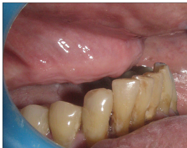
Figure 3: Pseudo class III profile in long standing maxillary edentulism due to the supraeruption and proclination of mandibular anteriors