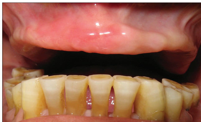
Figure 2: Severely resorbed edentulous maxillary arch and status of opposing dentition showing worn teeth, leading to defective plane of occlusion