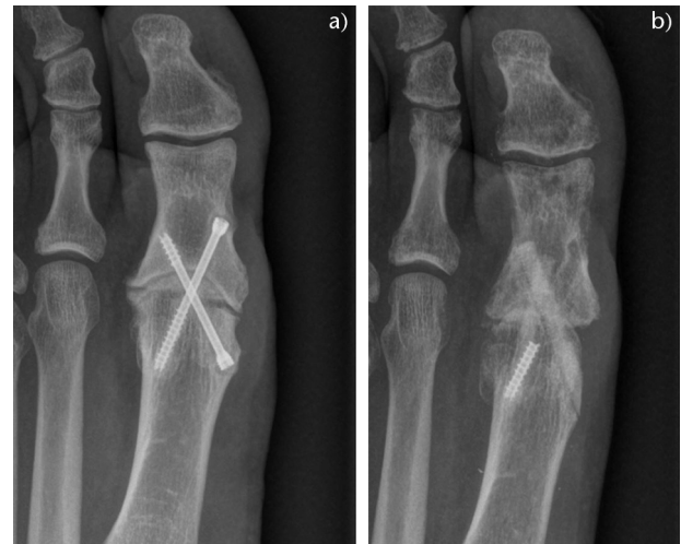
Fig. 2 Pseudarthrosis in a 48-year-old male five years after MTP-1 (first metatarsal-phalangeal) arthrodesis with a titanium screw (a, left). Solution with two cortical screws three months after revision surgery (b, right).

Magnesium-based implants are degraded by corrosion, the formation of highly soluble magnesium chloride, hydrogen gas and therefore a relevant change in the environment of the surrounding tissue. The corrosion reduces the local inflammatory reaction in the bone as well as the irritation in the surrounding tissue and therefore leads to less osteolysis. Gas bubbles may be responsible for separation of tissue layers and subcutaneous irritation but disappear within weeks after initial surgery. 43 A model study showed complete resorption after 12 months with normal