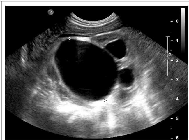
FIGURE 2 | US scan of a severe dilatation in uretero-pelvic junction stenosis.