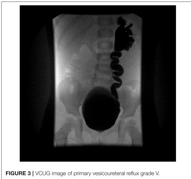
FIGURE 3 | VCUG image of primary vesicoureteral reflux grade V.

ureteral reimplantation) depends on several factors such as the grade of VUR, the clinical course in terms of UTI recurrence, the presence of renal scars, ipsilateral renal function, bilaterality, bladder function, associated anomalies of the urinary tract, age and parental preference (36).