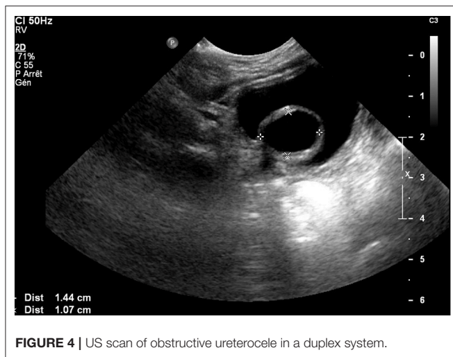
FIGURE 4 | US scan of obstructive ureterocele in a duplex system.

>10 mm, the condition may take time to resolve (11). According to the British Association of Pediatric Urologists (BAPU), surgical intervention is indicated in the presence of symptoms as recurrent febrile UTIs, impaired renal function associated with massive or progressive hydronephrosis, or a drop in differential function on serial renograms (44). In these cases, the BAPU recommends a ureteral reimplantation in patients over 1 year of age even though the procedure may be challenging in small children (44).