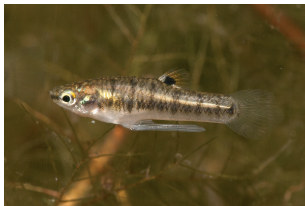
Figure 1. A Heterandria formosa male.

We estimated population densities and collected H. formosa males from 15 North Florida populations in May 2012. We estimated adult density (adults per 0.5 m 2 ) in each population using methods described elsewhere (Leips and Travis 1999; Richardson et al. 2006). Briefly, we employed a stratified sampling procedure in which, at each site, we threw the trap, haphazardly, three times in shallow, nearshore vegetated areas. The contents of each trap throw were removed with 10 sweeps of a dipnet and