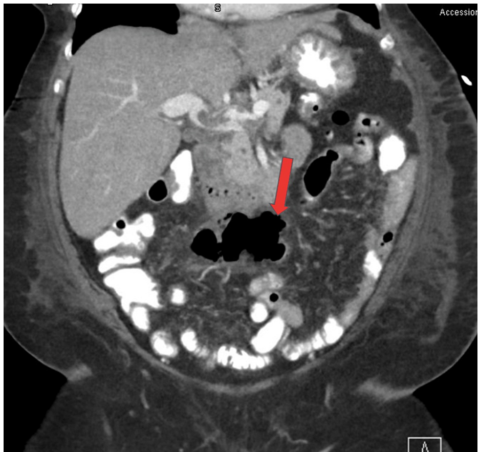
FIGURE 3: Second computed tomography of the abdomen showing enlarging mesenteric abscess extending from left to right lower quadrant

The patient was re-evaluated by the surgery and IR team and was not a candidate for any intervention. Intravenous antibiotic treatment was continued for 13 days, and it was switched to oral amoxicillin-clavulanate for additional two weeks. The patient was started on oral apixaban for portal vein thrombosis and acute DVT. An abdominal CT scan was repeated on day 15, which was unchanged from the previous one. At the time of discharge, she was advised to follow up with her primary care physician and hematologist to repeat a CT scan of the abdomen and close monitoring.