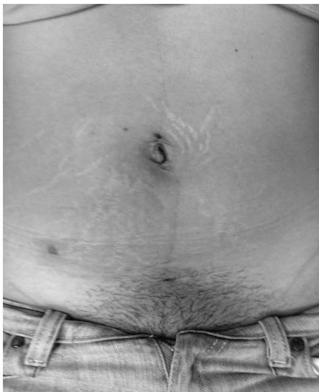
Figure 3. Cosmetic result of laparoscopic approach (umbilical incision not noticeable underneath pre-existing umbilical piercing).

complications (eg, bowel perforation, bowel obstruction, abscess formation, or peritonitis), additional imaging such as computed tomography scanning or magnetic resonance imaging may be needed. 15