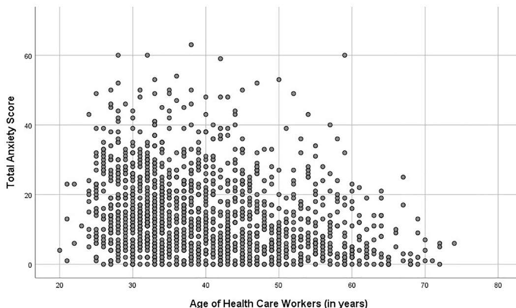
Fig. 1. The relationship between age and BAI score.

Anxiety arising from exposure to life-threatening viral infections is a significant challenge to HCWs [19]. During outbreaks, HCWs are forced to cope with high emotional stress due to the risk of exposure, extreme