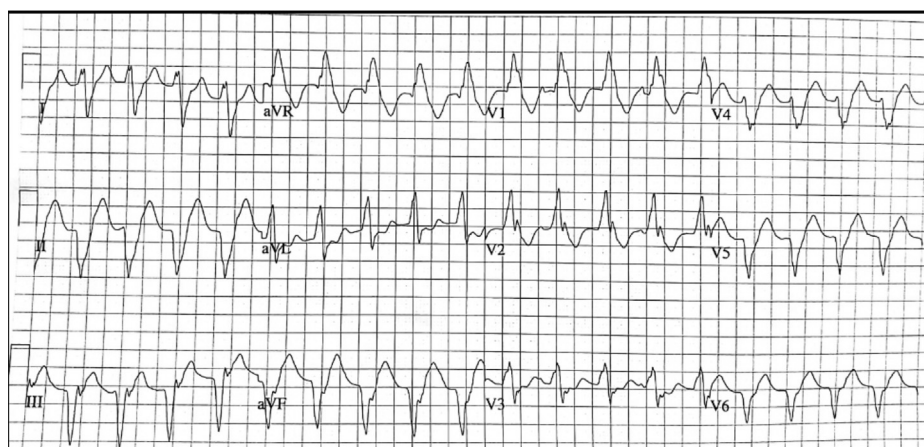
Figure 1 Electrocardiogram showing ventricular tachycardia at a rate of 120 beats per minute.

the incessant VT settled and the patient was 100% atrially and ventricularly paced.