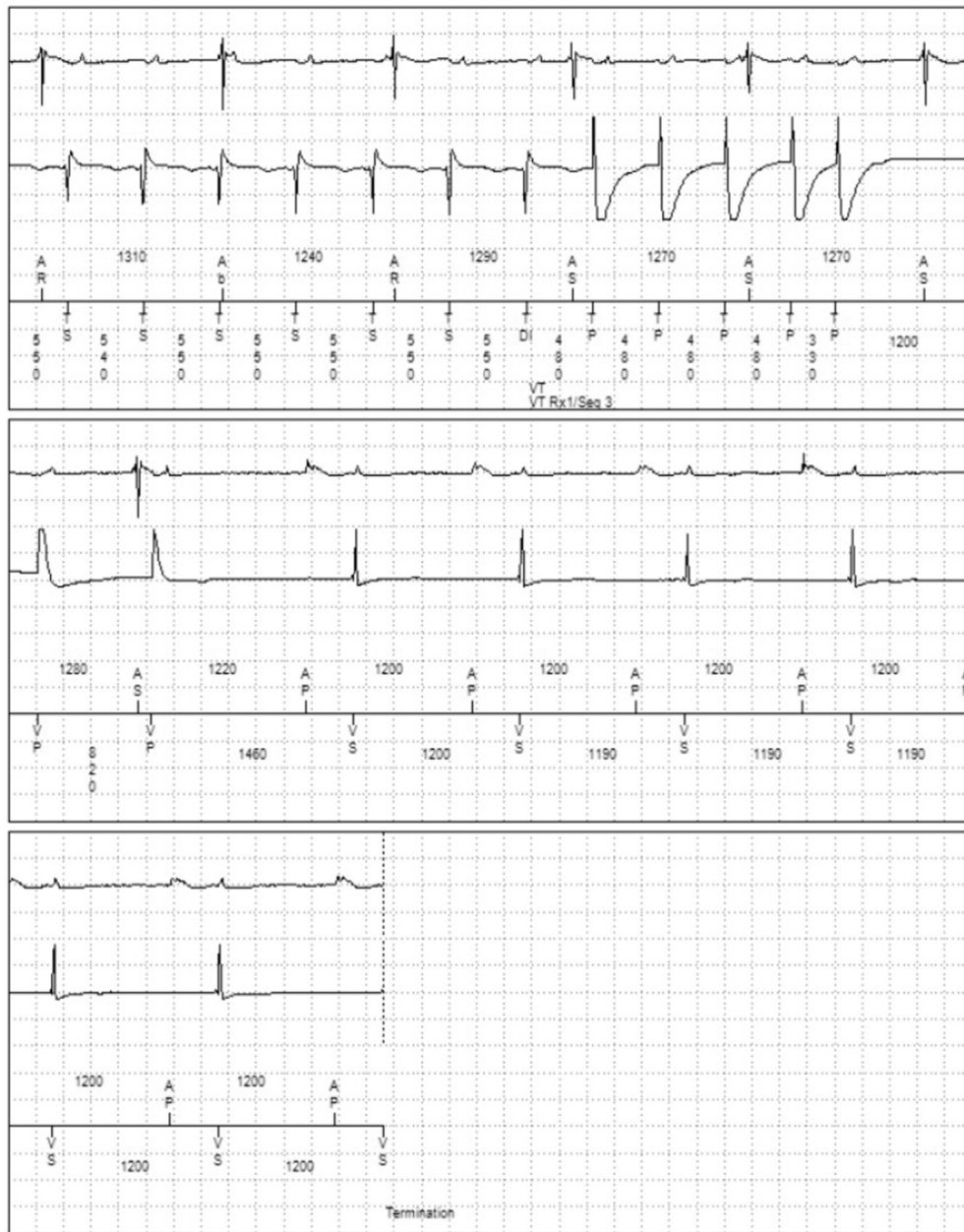
Figure 3 Image taken from Medtronic programmer demonstrating the successful conversion of ventricular tachycardia to sinus rhythm owing to the Intrinsic ATP (iATP) automated ventricular antitachycardia pacing algorithm. There are 2 ventricular paced beats after conversion, then intrinsic rhythm takes over (as per device programming).

and S3 pulse is decremented thereafter to continue searching for efficacy until minimal coupling of 160 ms has been attempted. By this time, if shocks are programmed, shock therapy would be delivered. If criteria for adjustment of the clinical arrhythmia ( >10\% change in VT cycle length) are met at any time during iATP therapy, the algorithm is reset to the initial S1 impulse determination stage.