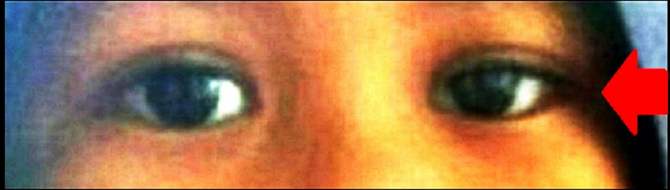
FIGURE 2: Significant bilateral ptosis improvement after a one-week initiation of pyridoxine and thiamine treatment