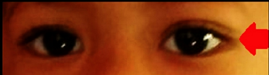
FIGURE 3: Complete resolution of bilateral ptosis following pyridoxine and thiamine treatment