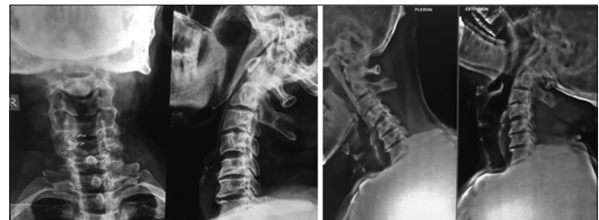
Figure 3: A 53-year-old male immediate and postoperative images at 5-year follow-up

Undercutting of C2 and C7 laminae with foraminotomy of C5 was done to provide adequate decompression.