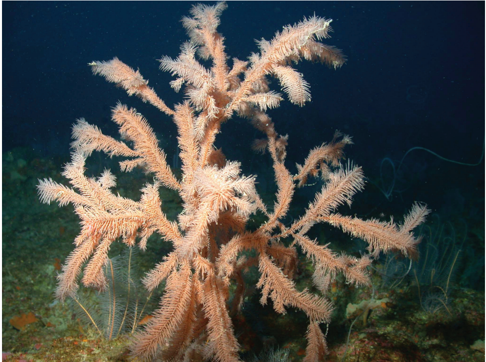
Figure 1. Deep reef habitat showing antipatharians Tanacetipathes sp. (foreground) and Stichopathes sp. (distant) among protruding arms of comatulid crinoids (West Flower Garden Bank, 80 m).

collection. Because the two species are considered to be obligate associates of antipatharians, we are confident that they were living on antipatharians before collection. MW identified the carideans and most of the cirripedes. Stephen Gittings, United States National Oceanographic and Atmospheric Administration, identified the specimens of Oxynaspis gracilis Totten from DFH8-19A14.