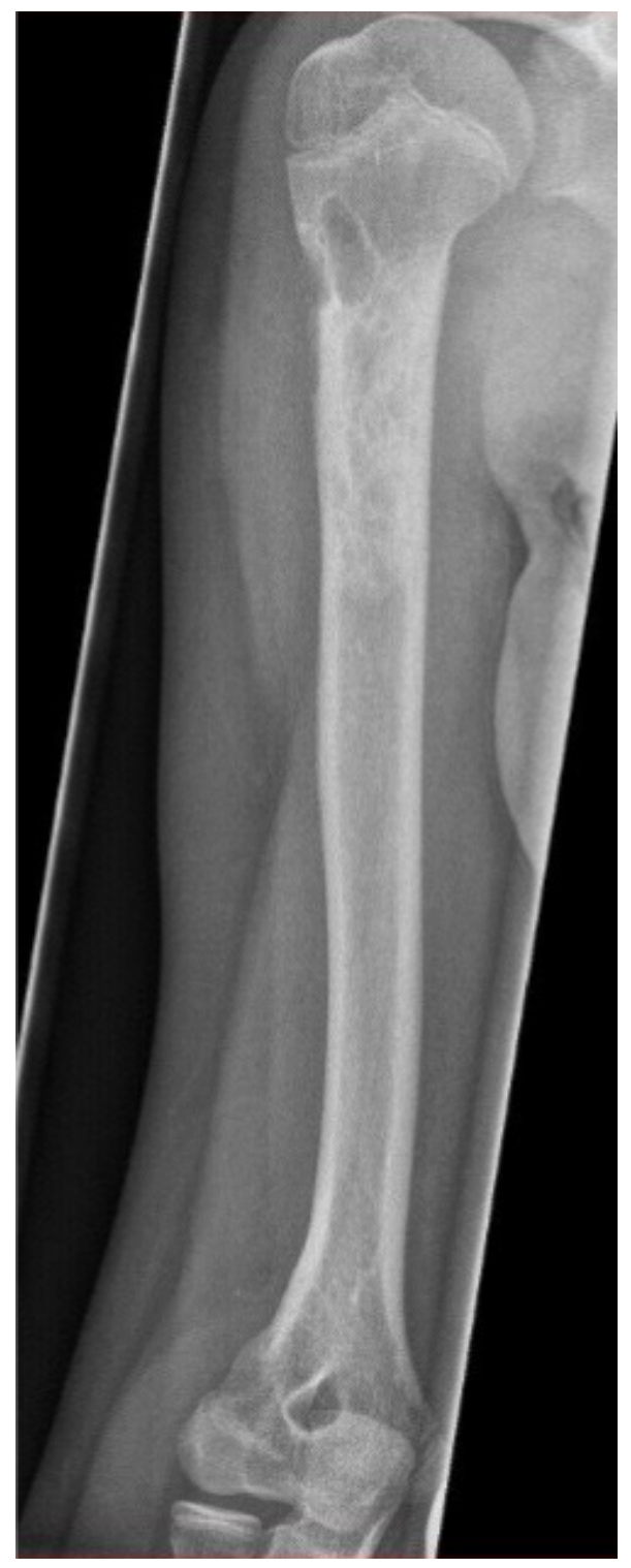
Figure 12 Incomplete filling of the cyst. 23 months after nail removal. Small residual cyst in the area of the former postoperative defect (Capanna Typ 2).

with their appearance. No patient showed any changes in their intra- or postoperative vital parameters. The most significant benefits of using the GPS<sup>®</sup>-System are its autologous nature, the fact that it is endogenously derived and its easy availability. There are no issues of immunogenicity or transmission of infection by using the GPS<sup>®</sup>-System or the artificial bone substitute Orthoss<sup>®</sup>. Hass reported the successful use of demineralized human bone matrix (Grafton<sup>®</sup>) for the treatment of bone cysts in seven children. The disadvantages of this approach are the high costs and the, albeit low, risk of infection [42].