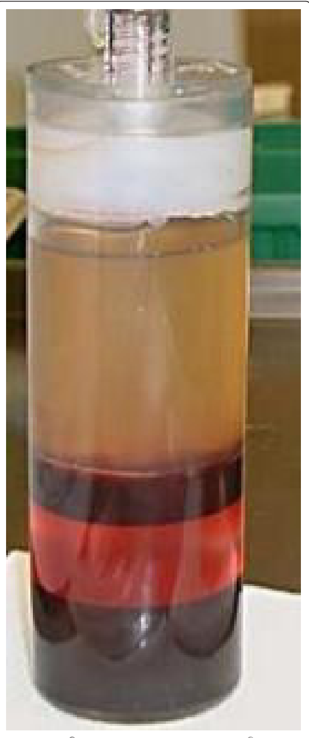
Figure 1 GPS®-Tube after centrifugation . The GPS® tube after centrifugation: The red blood cells fraction at the bottom of the tube is separated from the buffy coat by a buoy. The platelet-rich plasma is above and is separated from the platelet-poor plasma after the white plunger is manually pushed down.