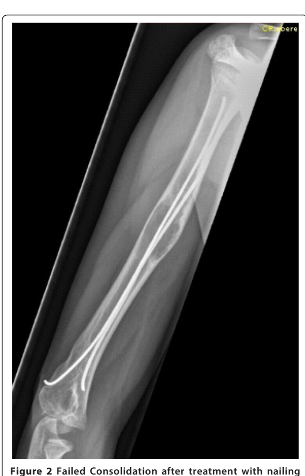
alone. Persistence of cyst after earlier failed treatment (Elastic stable intramedullary Nailing 4 years previously).

http://www.biomedcentral.com/1471-2474/12/45