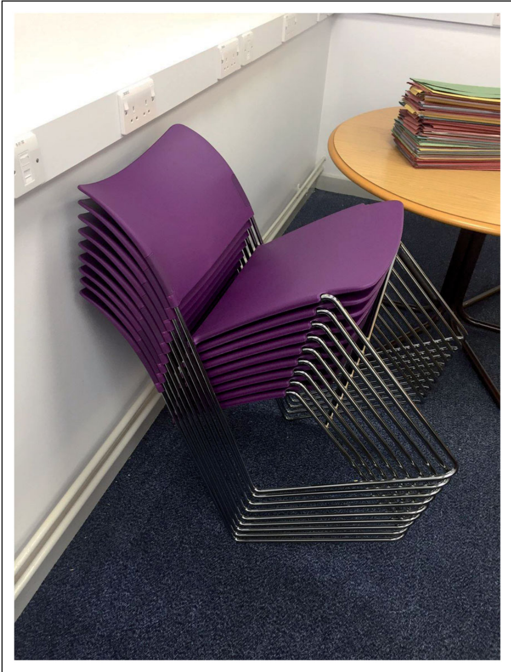
Figure 1. The stacking chairs.

The stimulus superficially calls to mind the Penrose triangle (Penrose & Penrose, 1958), the critical difference between the two being that the latter has no real-world interpretation (it is a paradoxical figure, and geometrically impossible), whereas the former does: A, B, C, D, E and F all being in roughly in the same vertical plane. But the misleading local three-dimensional