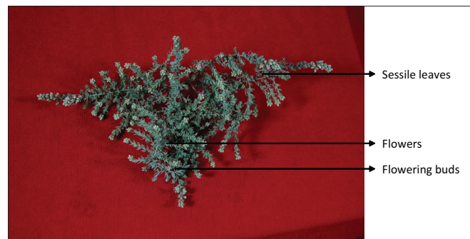
Figure 1: Showing flowers, flowering tops, and leaves with branching stem

It is also reported that the fruits of C. cretica are a potential source of edible oil. The oil of C. cretica was free from any undesirable