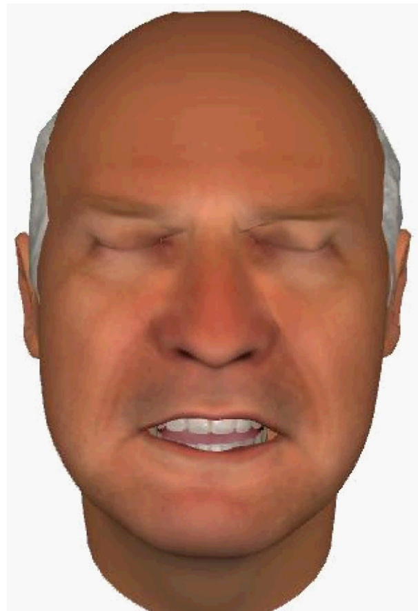
Figure 2 Still frame of a VH patient displaying high pain. Abbreviation: VH, virtual human.

Of the 96 participants who completed this study, approximately 60% were female, 65% were Caucasian, 69% were non-Hispanic, and 96% were single. The average age of the participants in this study was 20.6 years.