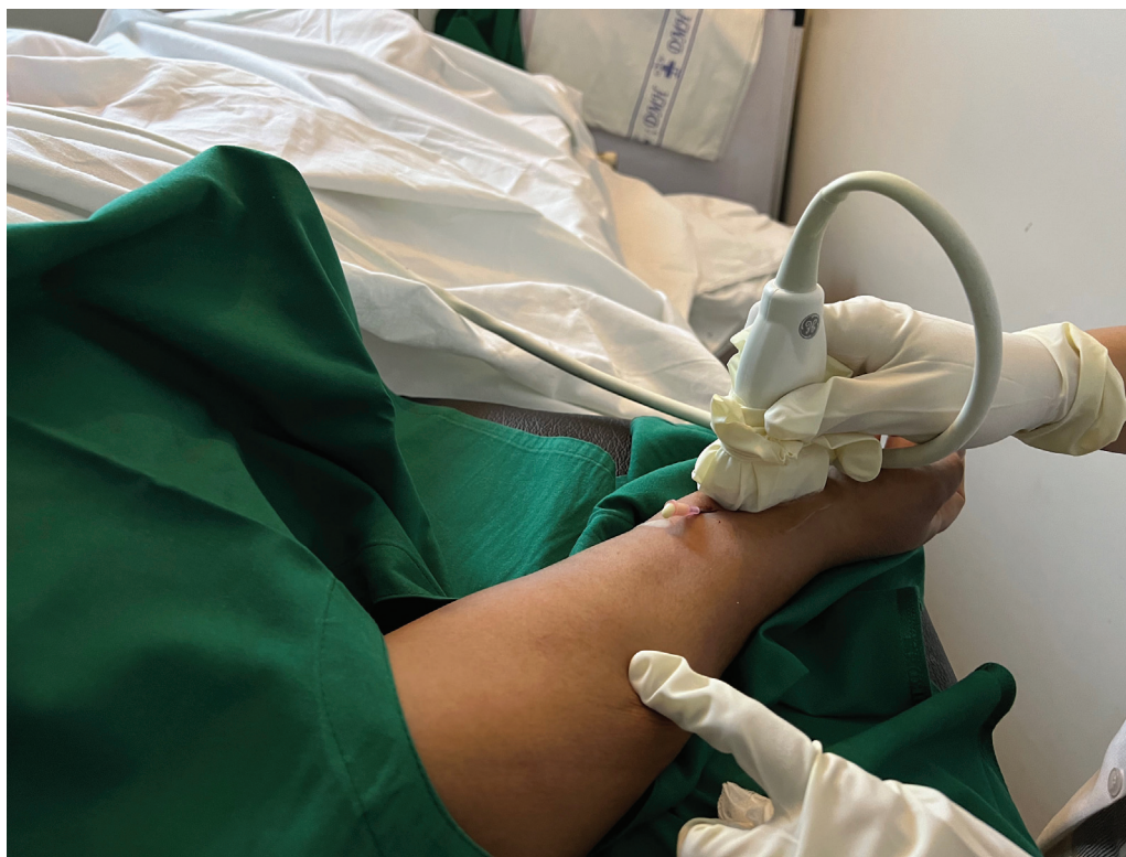
Fig. 3 Ultrasound-guided lavage procedure demonstrating patient and needle position. Note the milky white aspirate of calcific material from the needle.

deposits to surrounding tissues, and hence it is this phase of the disease that is most painful and symptomatic. 2,12 Post-calcific phase involved formation of granulation tissue and tendon remodeling. Bianchi and Becciolini 2 described three distinct types of calcification which can be seen in the disease, based on the percentage of calcium within the deposits; type 1 which is calcium rich and correspond to formative and resting phases, and these present as hyperechoic foci with acoustic shadowing on ultrasound; type 2 calcifications which are hyperechoic but only show faint acoustic shadowing, and type 3 calcifications which are isoechoic to tendons, appear ill-defined and show no acoustic shadowing. Types 2 and 3 usually correspond to the resorptive phase and hence more likely to be encountered in acutely symptomatic patients. While the pathogenesis described by Uthoff and Loehr 12 and calcification types described by Bianchi and Becciolini 2 specifically refer to calcific tendinopathy, similar parallels can be drawn to patients with calcific periarthritis as both conditions result from deposition of hydroxyapatite crystals. The patient described in this report had typical type 3 calcifications, which appeared poorly defined on ultrasound without any acoustic shadowing, and her acute excruciating symptoms at time of presentation suggested the disease was in the resorptive phase.