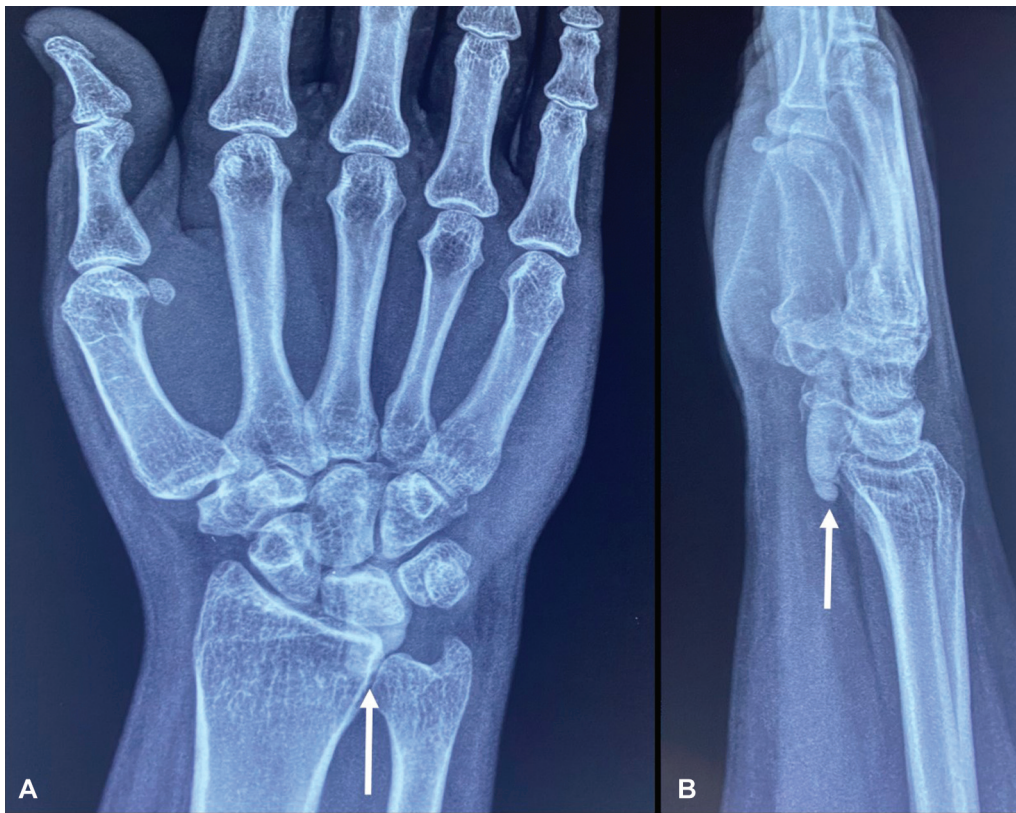
Fig. 2 Anteroposterior (A) and lateral (B) radiographs demonstrating soft, mass-like calcification within the carpal tunnel (white arrows).

The patient was initially managed with ultrasound-guided barbotage of the calcific deposits. After administering local anesthesia, an 18-gauge hypodermic needle was introduced into the mass-like calcification in the carpal tunnel, taking care to avoid the overlying flexor tendons and median nerve. Under direct visualization, the calcification was simultaneously fragmented and flushed with approximately 5 mL of normal saline (► Video 3 ). The contents were then aspirated into a 10 mL syringe via the same needle until the calcification was substantially reduced in size; the latter was visualized in real time (► Video 4 ). A milky white solution was aspirated (► Fig. 3 ). Following this, 40 mg of methylprednisolone acetate, a corticosteroid, was injected into the carpal tunnel.