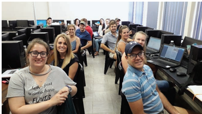
Figure 4. A computer lab where students learn to perform data and statistical analysis at the University of the Free State.

To practice as an animal scientist in South Africa, animal science graduates are required by law (Act 27/2003) to register at the national legislated regulatory body of the South African Council for Natural Scientific Professions (SACNASP). According to the SACNASP guidelines, students that obtained a 4-year BSc degree or a BSc Honors degree, together with relevant work experience, qualify to register as a professional natural scientist, whereas a 3-year BSc or BAgric degree allows only registration for candidate and certificated membership. Registration at SACNASP ensures that only registered persons may practice in a consulting and advisory capacity and that persons practice strictly within their area of competence. Both the South African Society for Animal Science and the World’s Poultry Science Association are voluntary associations with SACNASP and ensure that registered animal scientists continue to engage in academic activities by means of a continued professional development program. The validity and purpose