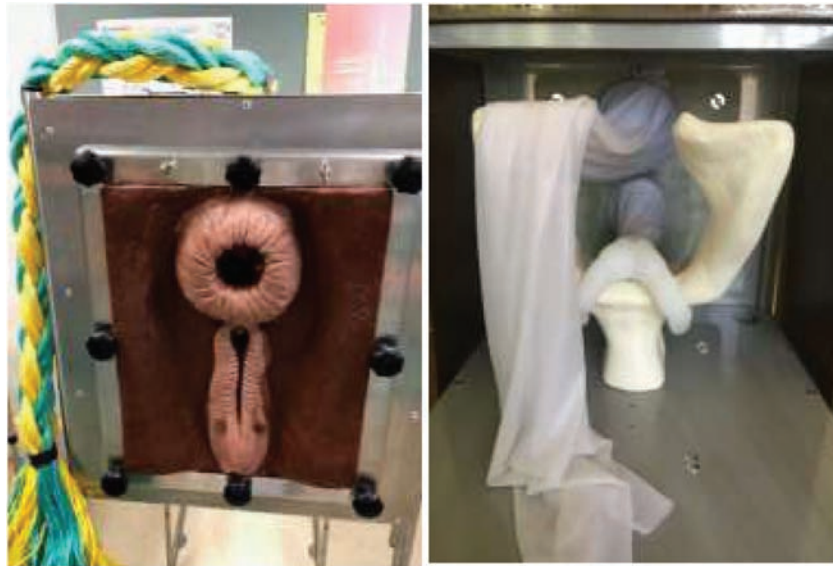
Figure 2. “Breed n Betsy” animal models are used for reproduction physiology training of students at most universities.

the most useful tools for training animal science students. While the training of undergraduate students in animal nutrition is less dependent on physical resource capabilities, limitations in the numerical and biochemical skills of students hamper the proper integration of theoretical and practical knowledge in the utilization of these software programs. Furthermore, limitations in terms of laboratory space for chemical analysis training of undergraduate students could be partly overcome by the use of near-infrared spectroscopy (NIRS) as a method of rapid feed analysis. The traditional training method of postgraduate students in animal nutrition has become expensive from a financial and time consuming point of view but is also very challenging from an ethical stance. While the substitution of live animals with alternative in vitro methods for the determination of feed digestibility does have some advantages on hand, the compromises in student training cannot be overlooked. It is