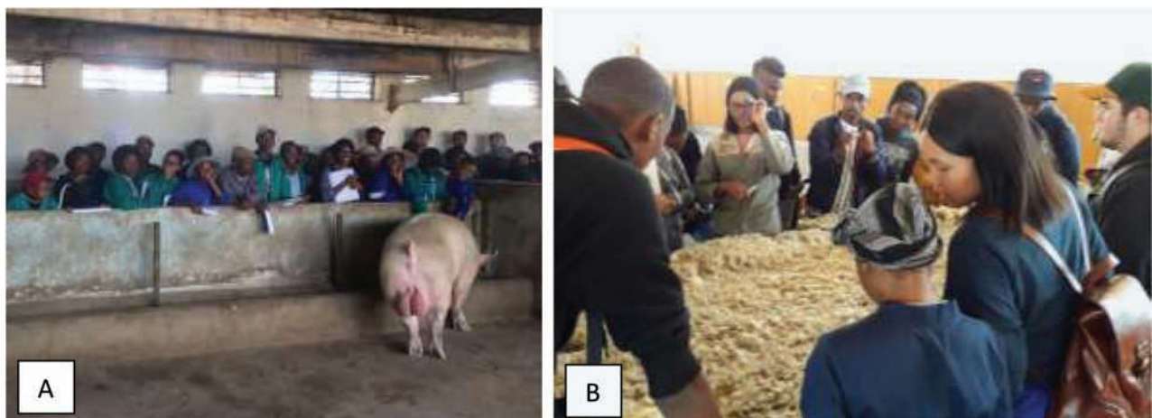
Figure 1. Practical training of students at the undergraduate level on (A) pig production systems and (B) wool quality and classification.

Use of computer software programs to formulate diets and model animal production performance efficiency are some of