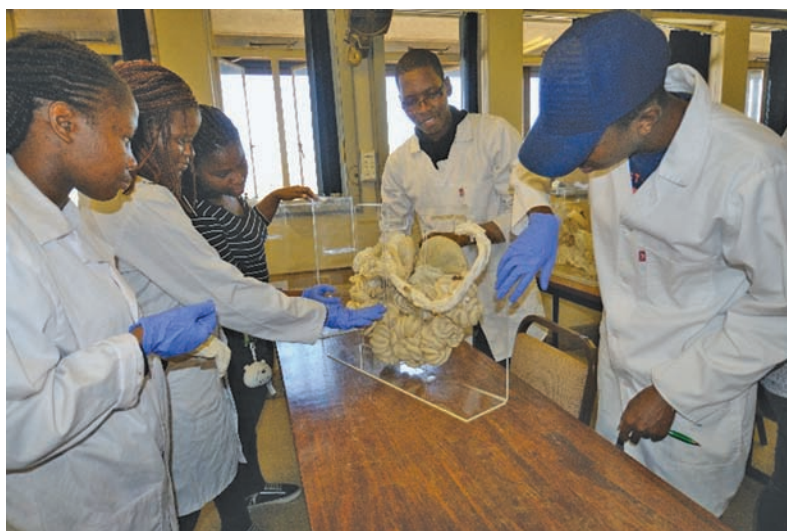
Figure 3. At the University of Pretoria synthetic organs are used for animal anatomy and physiology training.

Training students in animal breeding was primarily based on quantitative genetics but, since the development of DNA technology and advancements made in genomics, molecular genetics has also been incorporated in the animal science curriculums. Breeding programs focusing on data-led practices, both from quantitative and a genomics approach, to make well-informed decisions have become the norm. The existing animal science programs in South Africa have limited exposure to data science and much greater focus will have to be placed on mathematics,