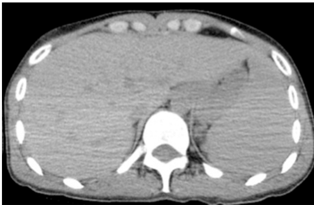
Figure 2 An abdominal CT showed hepatomegalies and splenomegalies.

Now she used wheelchair with assist but can stand with assist