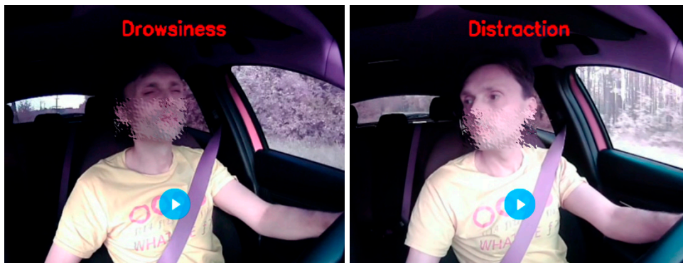
Figure 3. Drowsiness and distraction use cases.

We developed a software framework to support these use cases. The driver can record a video in vehicle cabin and then check it using the framework. The framework utilizes the Facebookes neural network model [52] to detect the driver's face and the Dlib framework to detect facial landmarks. Based on these landmarks, the drowsiness and distraction use cases are detected (Figure 3). For the unfastened belt, eating, drinking, smoking, and smartphone use cases (Figure 4) we developed a neural network model based on the YOLOv3 framework and a dataset that currently includes more than 3000 images of drivers in vehicle cabin. We use Java programming language to develop the cross platform prototype for the smartphone-based video analysis.