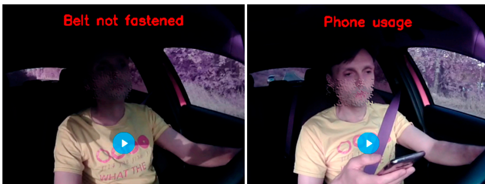
Figure 4. Unfastened belt and smartphone usage use-cases.

We conducted experiments (see Table 3) and estimated accuracy of the developed framework (described in details in [32,40]) based on in-vehicle experiments. The experiments were conducted for