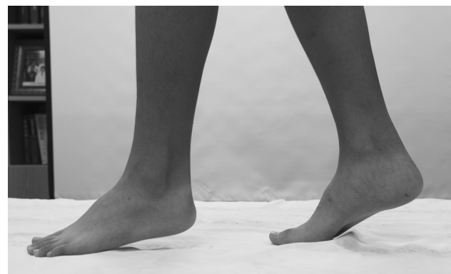
Fig. 1. A clinical photograph of the patient shows tip-toe gait during standing and walking.

Other than those of the ankles, the ROM of all joints were within the normal limits. No muscular atrophy was observed