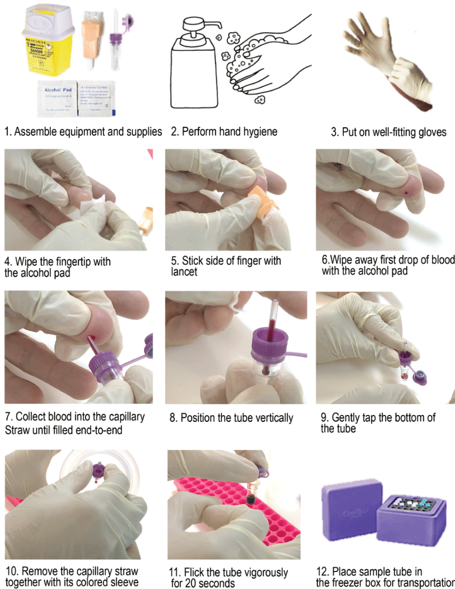
Figure 2. Illustration for capillary blood sampling. This figure illustrates the different steps involved in capillary blood sampling via finger stick.