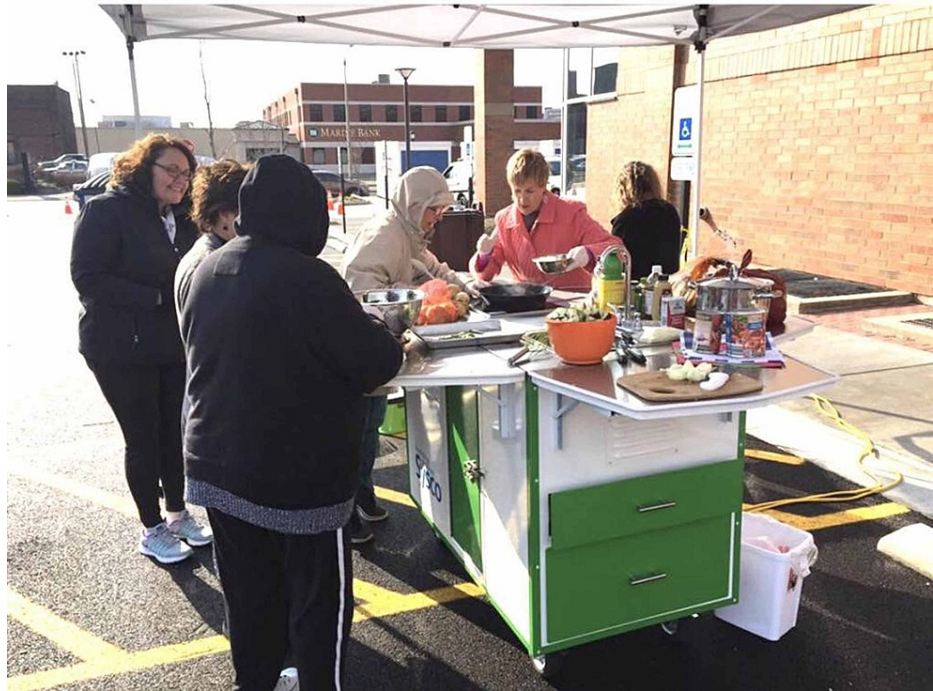
FIGURE 2: SIU Center for Family Medicine Diabetic educators teaching the public about healthy cooking during a health fair