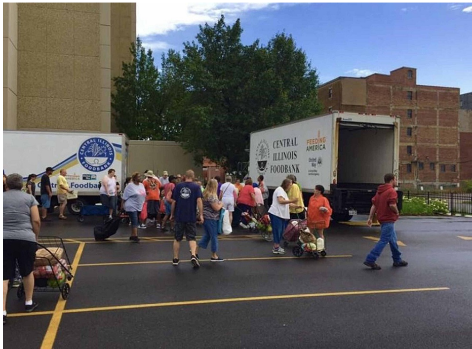
FIGURE 3: Central Illinois Foodbank distributing food at the FQHC at the SIU Center for Family Medicine

FQHC: Federally Qualified Health Center; SIU: Southern Illinois University