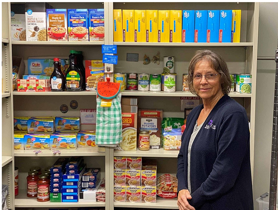
FIGURE 4: SIU Center for Family Medicine (FQHC) food pantry

SIU: Southern Illinois University; FQHC: Federally Qualified Health Center