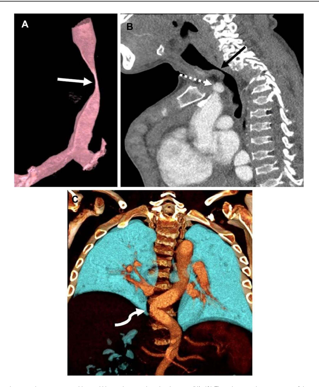
Figure I Computed tomography angiogram in a 16-year-old boy with mucopolysaccharidosis type IVA. (A) Three-dimensional reconstruction of the trachea in a sagittal oblique projection shows a severe narrowing of the trachea at the thoracic inlet (arrow). (B) Sagittal image shows that the brachiocephalic artery (dashed arrow) contributes to crowding at the thoracic inlet but does not directly indent the trachea (solid arrow). (C) Three-dimensional coronal reconstruction posteriorly in the chest shows tortuosity of the descending thoracic aorta, crossing the midline (arrow). Reprinted by permission from Springer Nature, Averill LW, Kecskemethy HH, Theroux MC, et al. Tracheal narrowing in children and adults with mucopolysaccharidosis type IVA: evaluation with computed tomography angiography. Pediatr Radiol. 2021;51(7):1202–1213. Figure I is copyright protected and excluded from the open access licence. 18

coordination, multidisciplinary clinics can improve patient satisfaction and quality of life.