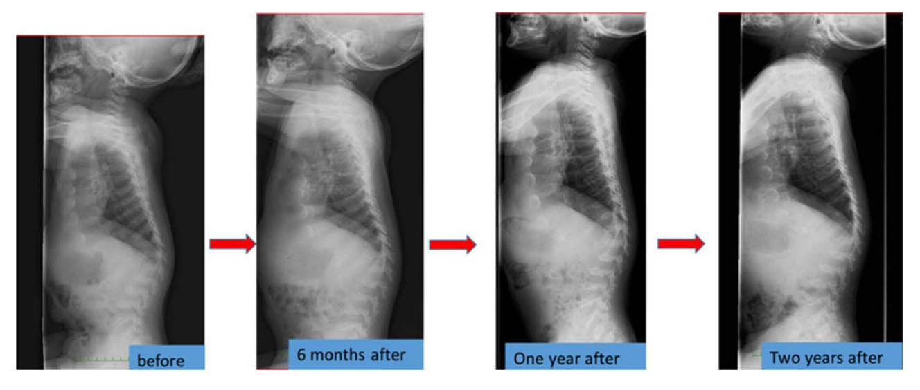
Figure 3 The spine X-ray findings before and after the enzyme replacement therapy in a Japanese boy with MPS IVA. Reproduced from Nakamura-Utsunomiya A, Nakamae T, Kagawa R, et al. A case report of a Japanese boy with MorquioA syndrome: effects of enzyme replacement therapy initiated at the age of 24 months. Int J Mol Sci. 2020;21 (3):989.<sup>72</sup>

We cannot currently predict which Morquio A patients will respond to ERT.<sup>61</sup> About 10% of patients have an excellent response that exceeds expectations. There is also a small group of patients who do not respond to ERT at all. Therefore, Morquio A patients receiving elosulfase alfa should have at least 12 months of treatment before assessing their response. The current quality-of-life assessment tools do not adequately capture the treatment benefits for patients.<sup>62</sup> We must develop improved and more innovative daily lifestyle measures to adequately assess clinical response. Lifestyle tracker apps could provide an all-day record of activity and sleep habits in