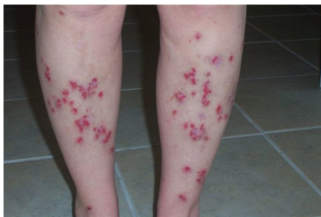
Figure 1 Morgellons patient's lower legs. Similar lesions covered her trunk and arms. There were no excoriations or secondary infections. Photo courtesy of Cindy Casey, Charles E Holman Foundation, Austin, Texas. Reproduced with permission.

modern medical literature, the reluctance on the part of the medical community to recognize it as anything other than psychopathology, and the lack of knowledge about its etiology and transmission. 6