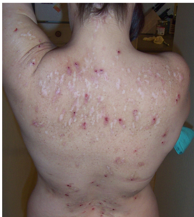
Figure 2 Morgellons patient's back. Note that lesions and scars occur in areas that could not have been reached by the patient.

In order to identify a homogeneous population for research purposes, it is important to develop a clinically-based case definition for Morgellons disease. To this end, we studied a group of subjects selected for a unique inclusion criterion in order to describe demographic, comorbidity, and symptom characteristics common to the population of Morgellons patients.