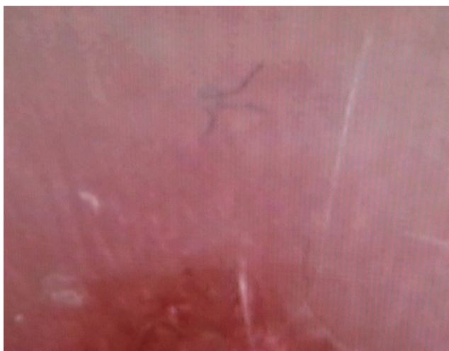
Figure 5 Fiber under epidermis (top) and separate from a skin lesion (bottom). Magnification 30 \times .

The convenience sample included all patients seen in the first author's San Francisco medical office who met the inclusion criterion. The subject inclusion criterion was a positive examination for microscopic subcutaneous fibers as visualized by the first author using a 60 \times handheld lighted magnifier. There were no exclusion criteria for the sample