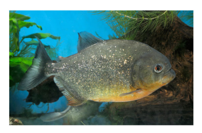
Fig. 1.—The sequenced red-bellied Piranha, Pygocentrus nattereri , female.

The red piranha DNA used for sequencing was derived from a single female (Collection ID: Pna-1) among a maintained laboratory population. Using the predicted 1.6 Gb genome size estimate of the white piranha (Carvalho et al. 2002),