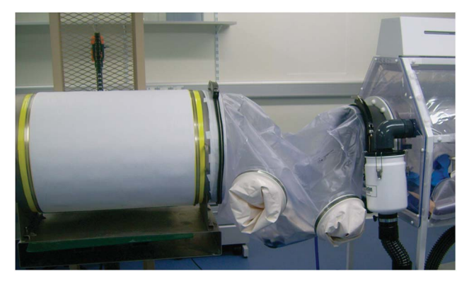
Figure 2 Sterile connection between a material drum and a flexible film isolator. The large steel drum contains sterile materials to be imported into the isolator, such as food, bedding, or cages. The drum is sealed and autoclaved and then connected to the isolator via a plastic sleeve that is sterilised by spraying with 2% peracetic acid, which then permits transfer of the sterile material into the isolator.

If plasticity of the microbiota metagenome is problematic over time, it should also be possible to restore an isobiotic system to defined starting conditions. This can be achieved