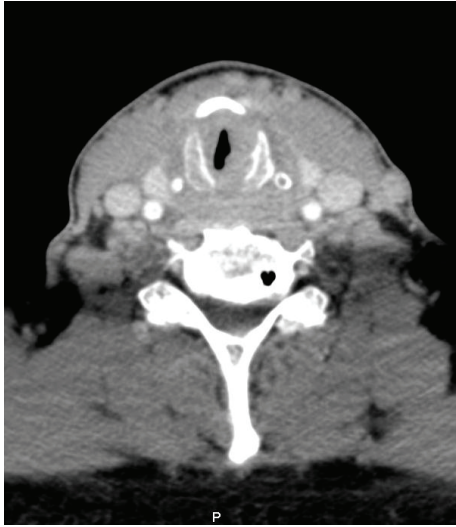
FIGURE 1: CT scan of the neck. Axial view showing subglottic edema and granuloma tissue on the left posterior commissure.