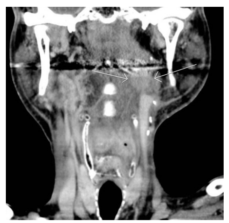
Fig. 2. A computed tomography scan revealed ovoid mass lesion compressing the left internal carotid artery.

30 seconds and headache. Syncope was heralded by a sensation of lightheadedness.