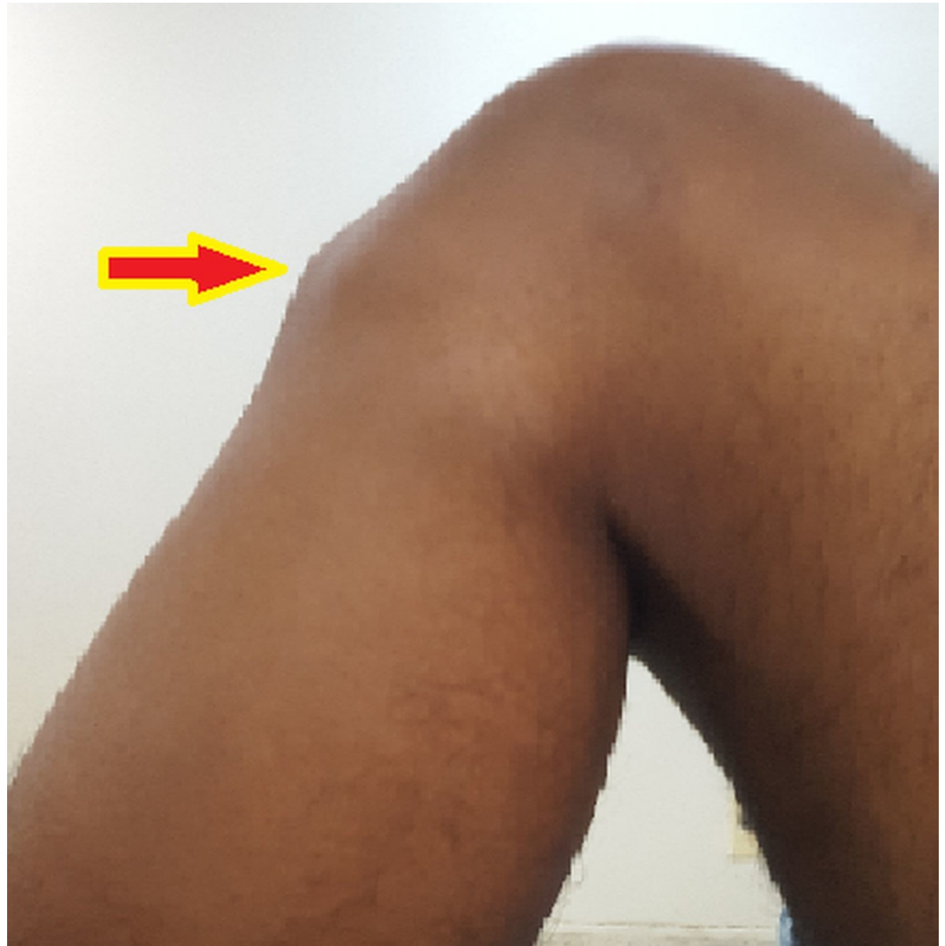
FIGURE 1: Bony prominence over the tibial tuberosity in OSD

Pain and swelling are the primary symptoms felt in the lower aspect of the knee, around the patellar attachment to the tibial tuberosity (Figure 1) [7-8].