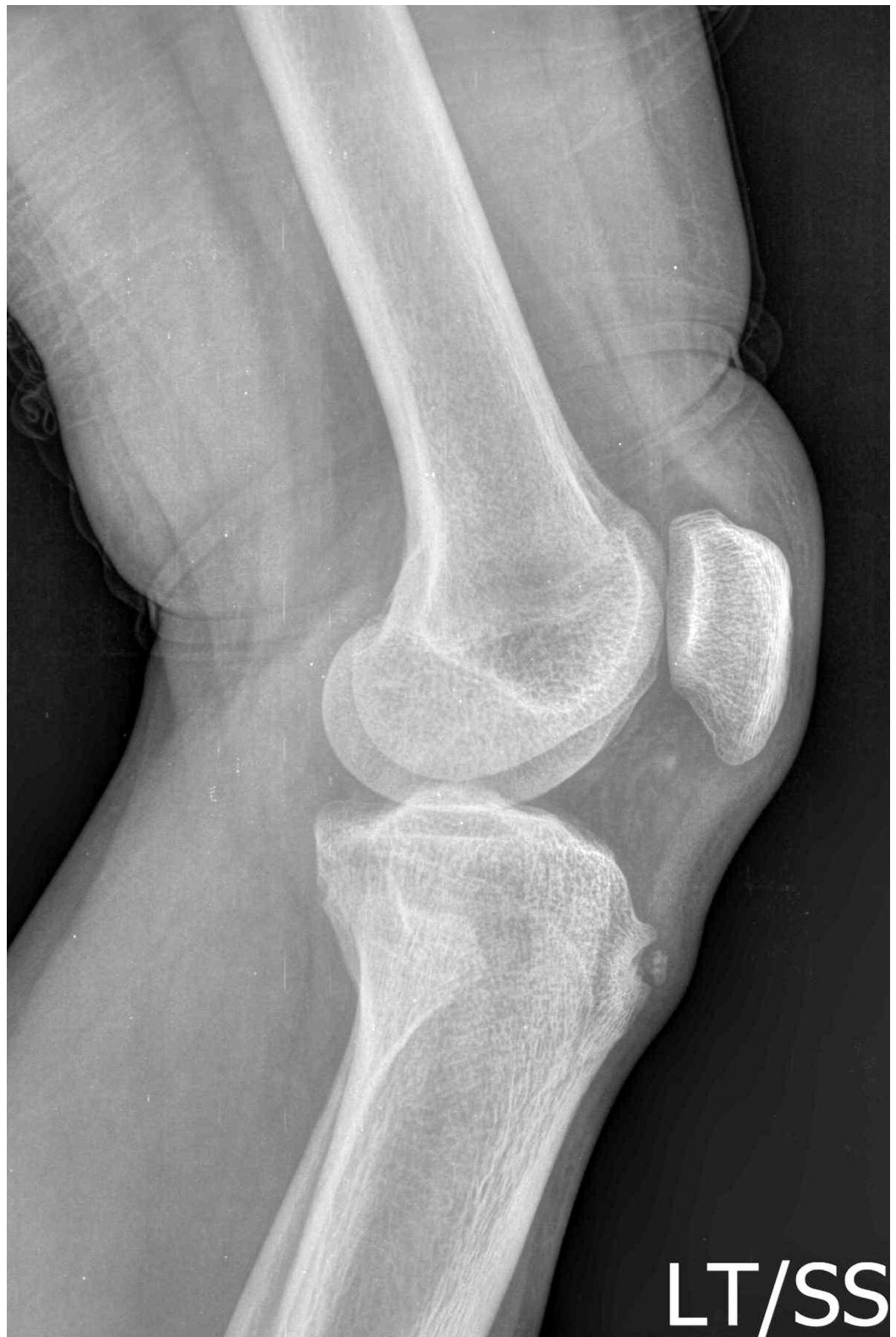
FIGURE 2: Separated ossicle and bony prominence seen in lateral radiography of knee in OSD.

Ultrasound may be useful as it determines any swelling in the soft tissue, cartilage, bursa, and tendon [9-10]. It also detects any new bone formation if present in the area. Magnetic resonance imaging is more sensitive than ultrasound and determines soft tissue swelling in front of the