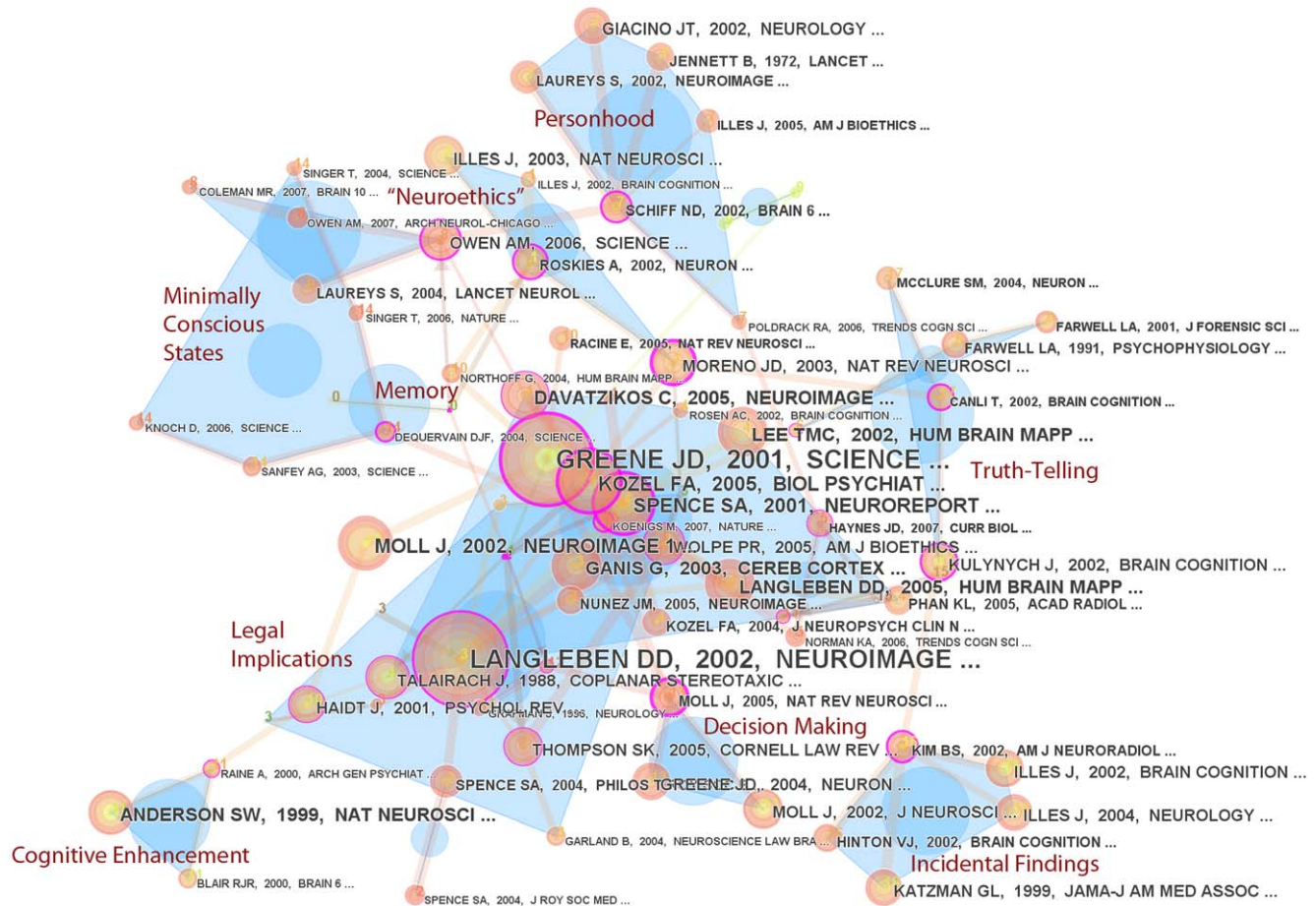
Figure 3. Citation network of neuroethics publications with topic clustering. doi:10.1371/journal.pone.0018537.g003

discussions about the technical limitations, persuasive power, or evidentiary constraints of neuroimaging. For example: