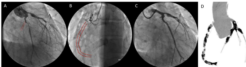
Figure 1. Coronary angiography (A–C) and computed tomography image (D) of three-vessel disease in a 22-year-old patient with polyarteritis nodosa. Angiography showed chronic total occlusion of the right and circumflex coronaries. Reproduced with permission from [26] under the creative common license ( http://creativecommons.org/publicdomain/zero/1.0/ ) (accessed on 3 March 2021).

Polyarteritis nodosa is a systemic necrotizing vasculitis which predominantly involves medium-sized arteries, more rarely small muscular arteries in middle-aged adults. Unlike microscopic polyarteritis, granulomatosis with polyangiitis, polyarteritis nodosa is antineutrophil cytoplasmic antibodies (ANCA)-negative [2]. It may affect virtually any organ in the body (kidneys, skin, joints, muscles, nerves, and gastrointestinal tract), usually in combination, but usually does not involve the lungs. Coronary involvement is considered to be rare but may be severe, including aggressive three-vessel disease with infaust outcome (Figure 1) [26]. Clinical sequelae of this involvement include congestive heart failure, hypertension, pericarditis, and arrhythmias.