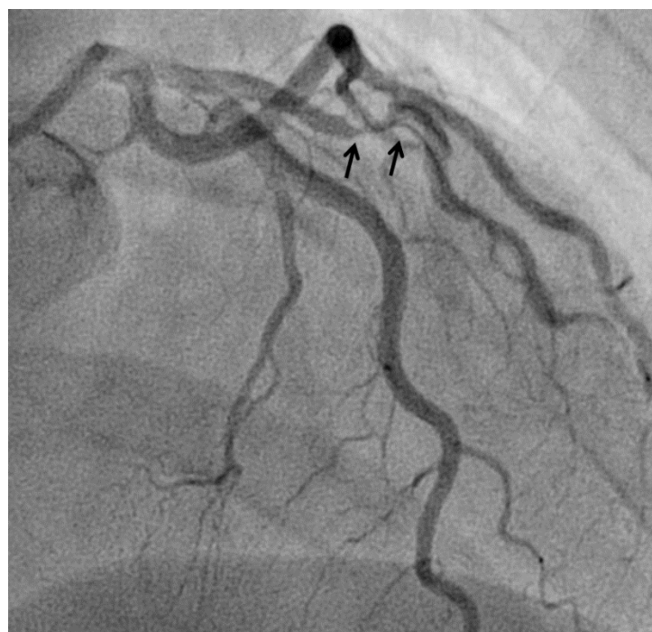
Figure 3. Spontaneous dissection (arrows) in a 45-years old woman causing non-ST elevation myocardial infarction.