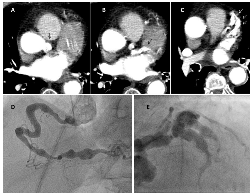
Figure 2. Coronary aneurysms in an 80-year-old female patient with stroke and rheumatoid arthritis. Panel a: right coronary; Panel b: left coronary (arrows mark the aneurysms). The patient had been admitted for sudden loss of consciousness. Chest computed tomography (panels A–C, Video S1) was performed for the suspect of lung embolism. The exam showed severe coronary aneurysms. At angiography (panel D,E), the aneurysms were so large that they could not be imaged in one single run despite large contrast volume.

2, diffuse disease that may involve all epicardial branches or only focal segments (10–20%); and 3, coronary aneurysms (0–5%) [23].