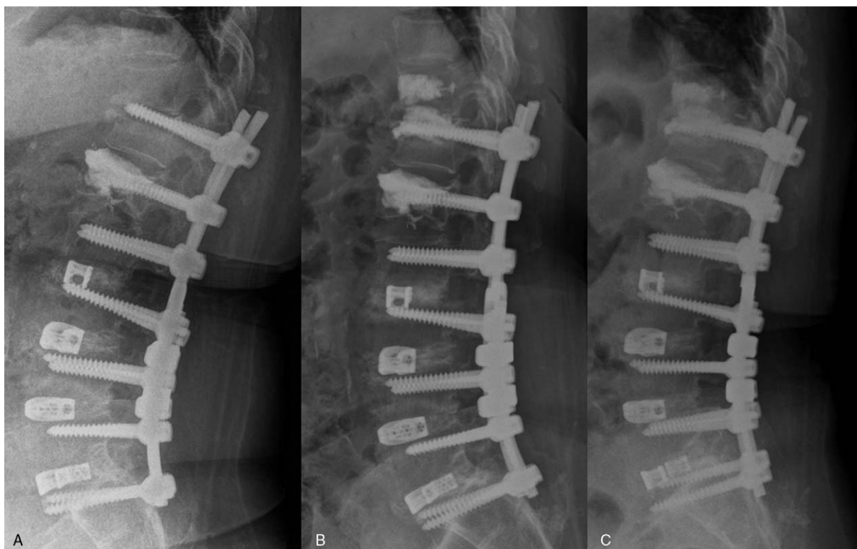
Figure 3. A 70-year-old woman with proximal junctional failure after posterior lumbar interbody fusion (case 4). (A) T11 proximal junctional fracture with penetration of T12 superior endplate by superior pedicle screw (case 4) revealed on X-ray. (B) Percutaneous cement injection was performed at the level of the T11 vertebral body and the T11-T12 disc space. (C) The thoracolumbar collapse showed minimal progression at the last follow-up.

revealed T11 PJF with penetration of the T12 superior endplate by a superior pedicle screw (Fig. 3A). PCI was performed at the level of the T11 vertebral body and the T11-T12 disc space to prevent collapse (Fig. 3B). The last follow-up visit took place in March 2017 and the thoracolumbar collapse showed minimal progression with only mild low back pain (Fig. 3C).