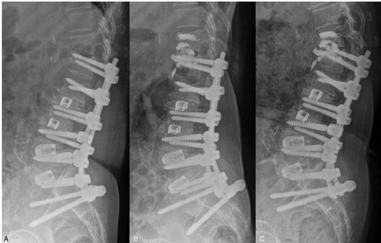
Figure 4. A 69-year-old woman with proximal junctional failure after posterior lumbar interbody fusion (case 7). (A) T12, L1 vertebral body compression fracture and L1 screw pull-out to superior endplate revealed on X-ray. (B) Percutaneous cement injection was performed at the level of the T12 and L1 vertebra bodies and discoplasty at the T12-L1 level. (C) Progression of local kyphosis and T12, L1 vertebral body fractures was seen on X-ray at the last follow-up.

in the segments of an instrumented body, the adjacent vertebra, and intervertebral disc is reasonable for treating PJF with proximal junctional fracture.