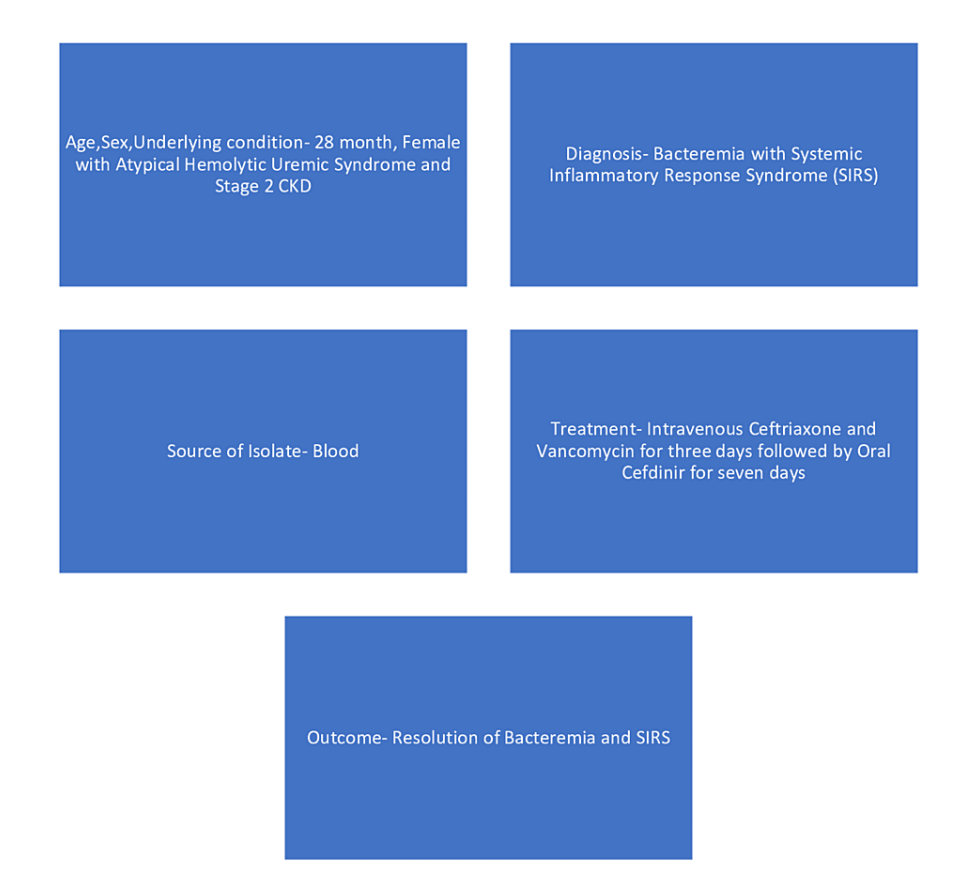
FIGURE 3: Description of Moraxella lacunata infection

CKD: Chronic kidney disease; SIRS: Systemic inflammatory response syndrome