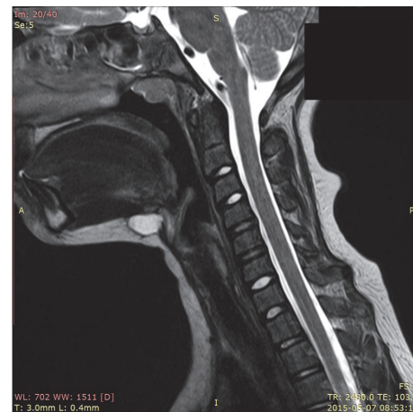
FIGURE 2: The recurrence of thyroglossal duct cyst (TGDC) in 12-year-old girl in MR imaging.

In 45 children (61.6%) the main symptom was an anterior neck swelling only and 20 patients (27.4%) presented with a swelling and a draining fistula and history of infection of the lesion (episodes of an abscess incision, recurrent discharge from the fistula) (Figure 1). Eight children (10.9%) required a revision surgery after the simple excision only—6 were operated on in another hospital, and 2 were operated on previously in our department before 2011. The location of the disease to the hyoid bone included the following: thyrohyoid (51 children, 69.9 %) and suprahyoid (21 children, 28.8 %). There was one case with lingual location in our material (1.3%) (Figure 3).