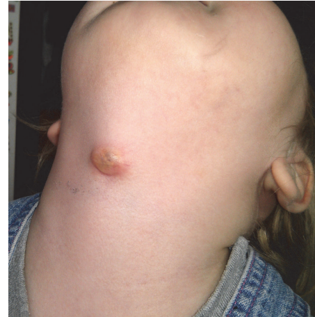
FIGURE 1: The infected TGDC in 2-year-old girl.

3.1. Demographic Data and Clinical Presentation. Forty-three patients were male (58.9%) and thirty were female (41.1%). The median age at the time of admission was 7.2 years.