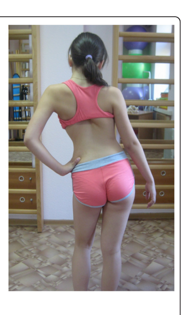
Figure 1 Patient with right thoracic scoliosis (functional 3curve pattern as seen on the left ) performing the correction of ADL in upright position ( right ).