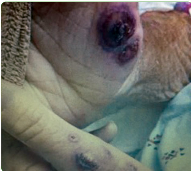
Figure 2. Hyperpigmented nodules on patient's hands; biopsy was suggestive of Sweet syndrome.

Sweet syndrome is an uncommon skin presentation of erythematous plaques or nodules