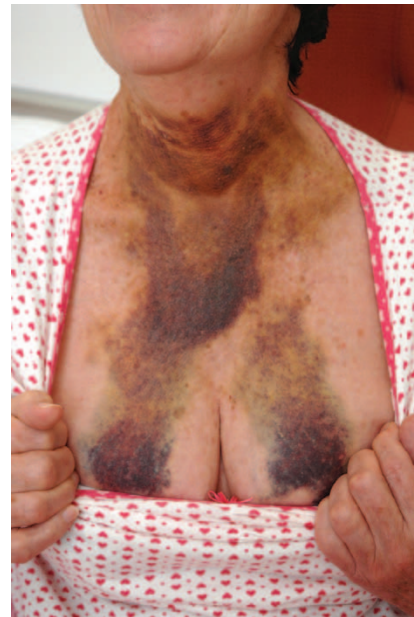
Figure 1. A photograph demonstrating the extent of bruising at presentation.

An urgent contrast-enhanced computed tomography (CT) scan of her thorax and neck was performed. The CT showed a large prevertebral soft tissue mass extending from the level